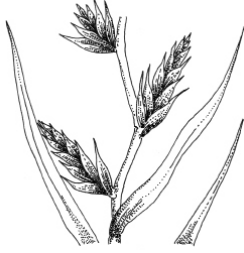
- Rye -