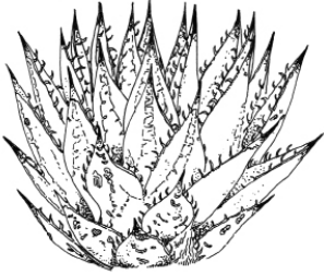
- Agave Plant -