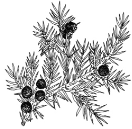
- Juniper -