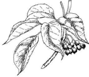
- Elderflower -