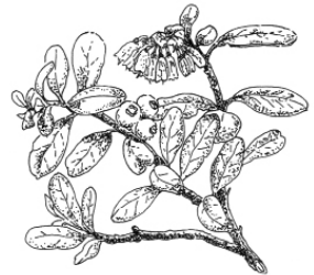
- Cranberry -