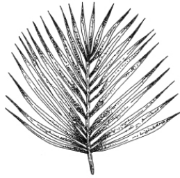
- Coconut Leaf -