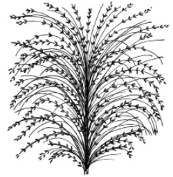
- Sugarcane -