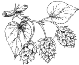
- Hops -