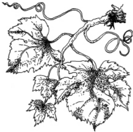
- Grape Vine -