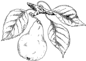
- Pear Leaf -